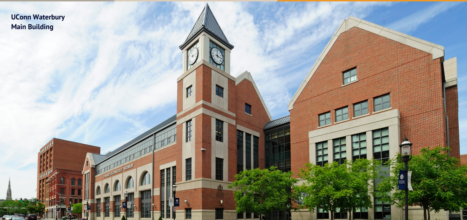
UConn Waterbury Main Building

The University of Connecticut's Waterbury Campus serves more than 1,100 students annually. In more than 60 years of operation, UConn Waterbury has opened the doors to educational access and excellence to thousands of Connecticut residents, many of whom have distinguished themselves in the fields of community service, business, education, law, and politics.