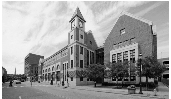
UConn, Waterbury Campus - Main Entrance (E. Main St.)

May the new year bring you great joy and surpassed expectations!